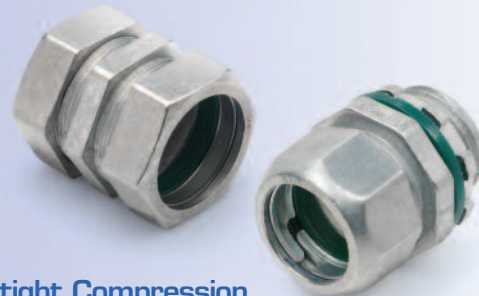
Raintight Compression Connectors & Couplings