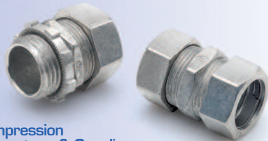
Compression Connectors & Couplings