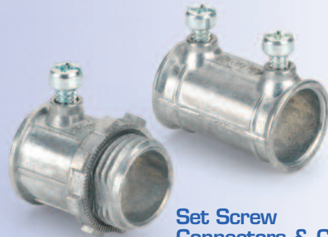
Set Screw Connectors & Couplings

The one thing you need for every EMT application: Bridgeport