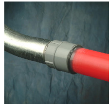
Polyethylene to Steel